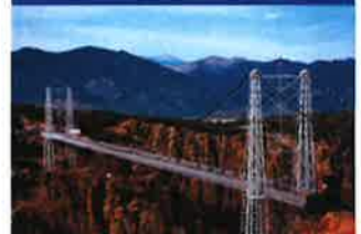
Visit to the Royal Gorge Bridge and Park