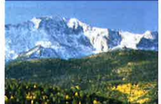
Famous Pikes Peak - America's Mountain