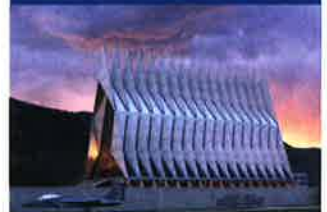
Visit to the U.S. Air Force Academy

Day 13: Today after enjoying a Continental Breakfast, you depart for home... a perfect time to chat with your friends about all the fun things you've done, the great sights you've seen, and where your next group trip will take you!